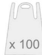
WHITE FLAT PACKED APRON (100)