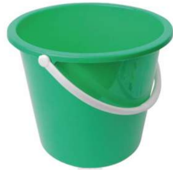
PLASTIC GREEN BUCKET 10LTR