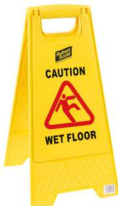
WET FLOOR/CLEANING PROCESS FLOOR SIGN (1)