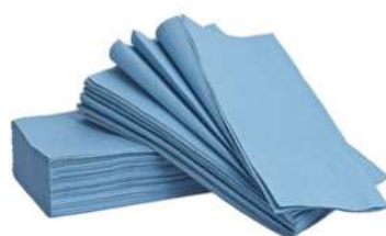
HAND TOWELS BLUE 1PK 2400PK