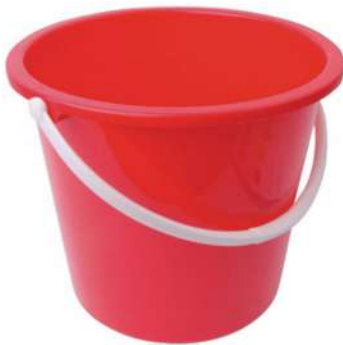
PLASTIC RED BUCKET 10LTR