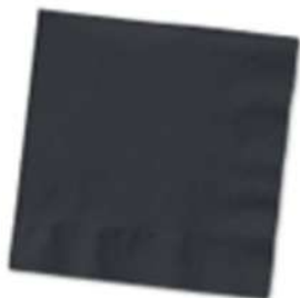
COCKTAIL NAPKIN BLACK, 4000PK