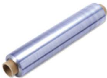
CLING FILM LARGE