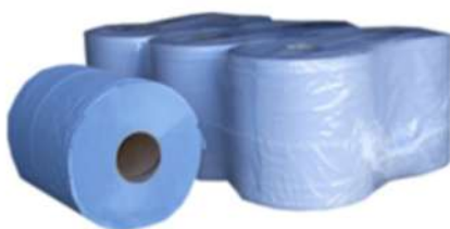
BLUE ROLL 1X6