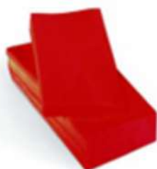
2PLY RED NAPKINS 8 FOLD 2000PK