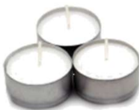
TEALIGHT CANDLES 8 HOURS (BAG X 75)