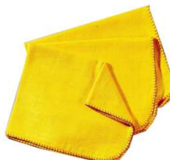
HEAVY YELLOW DUSTING CLOTHS (1X10)