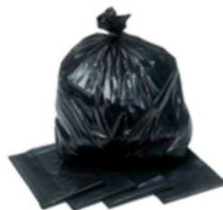
BLACK COMPACTOR BAGS 20KG - 100PK