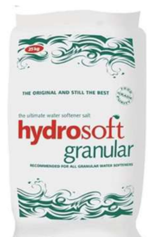
DISHWASH SALT, 25KG