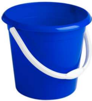
PLASTIC BLUE BUCKET 10LTR