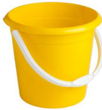
PLASTIC YELLOW BUCKET 10LTR