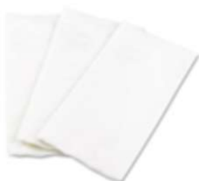
2PLY NAPKINS WHITE 8 FOLD (40CM) (2000)